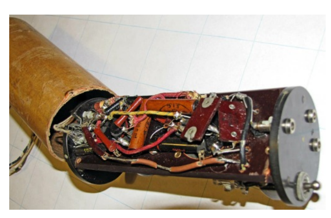
Bottom view of opened Töpö receiver showing the very adequate and lightweight construction.

Power Supply: 1.5VLT and 90-120V HT battery. Size (cm): Diameter 7, Length 18. Weight: 0.6kg, including batteries. Accessories: Headphones, batteries, aerial wire.